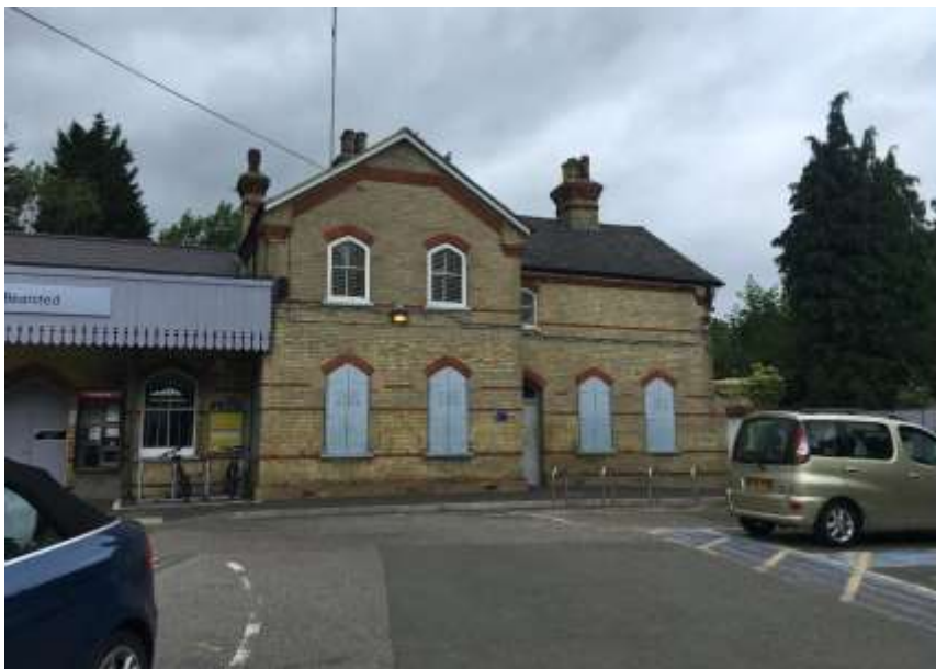
Front elevation of application site