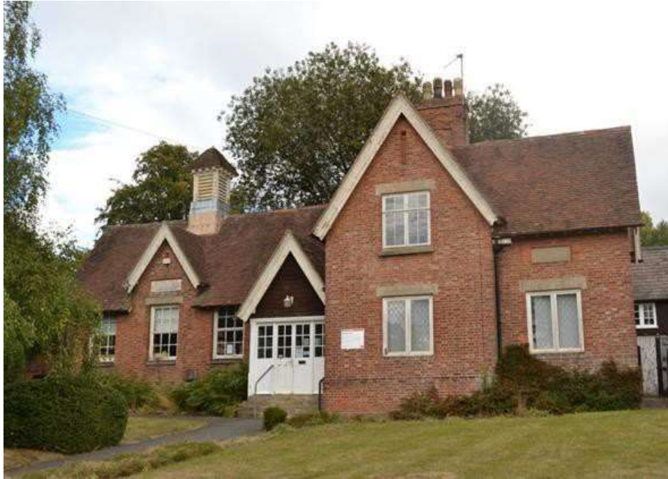
Bearsted Library which is now closed and is currently undergoing restorative works